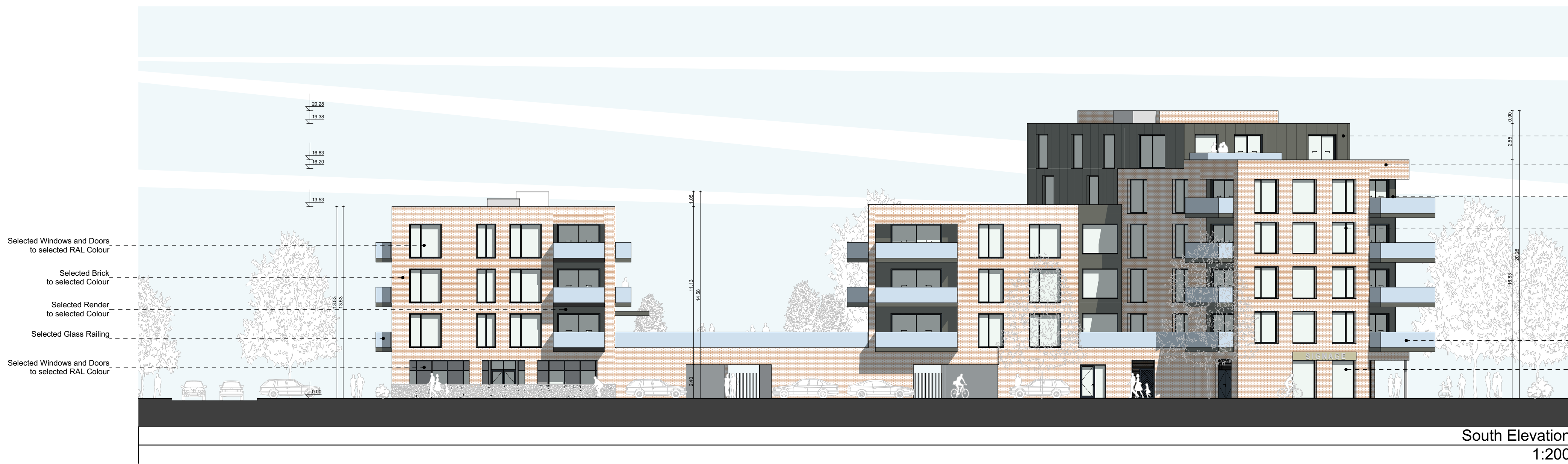
South Elevation 1:200