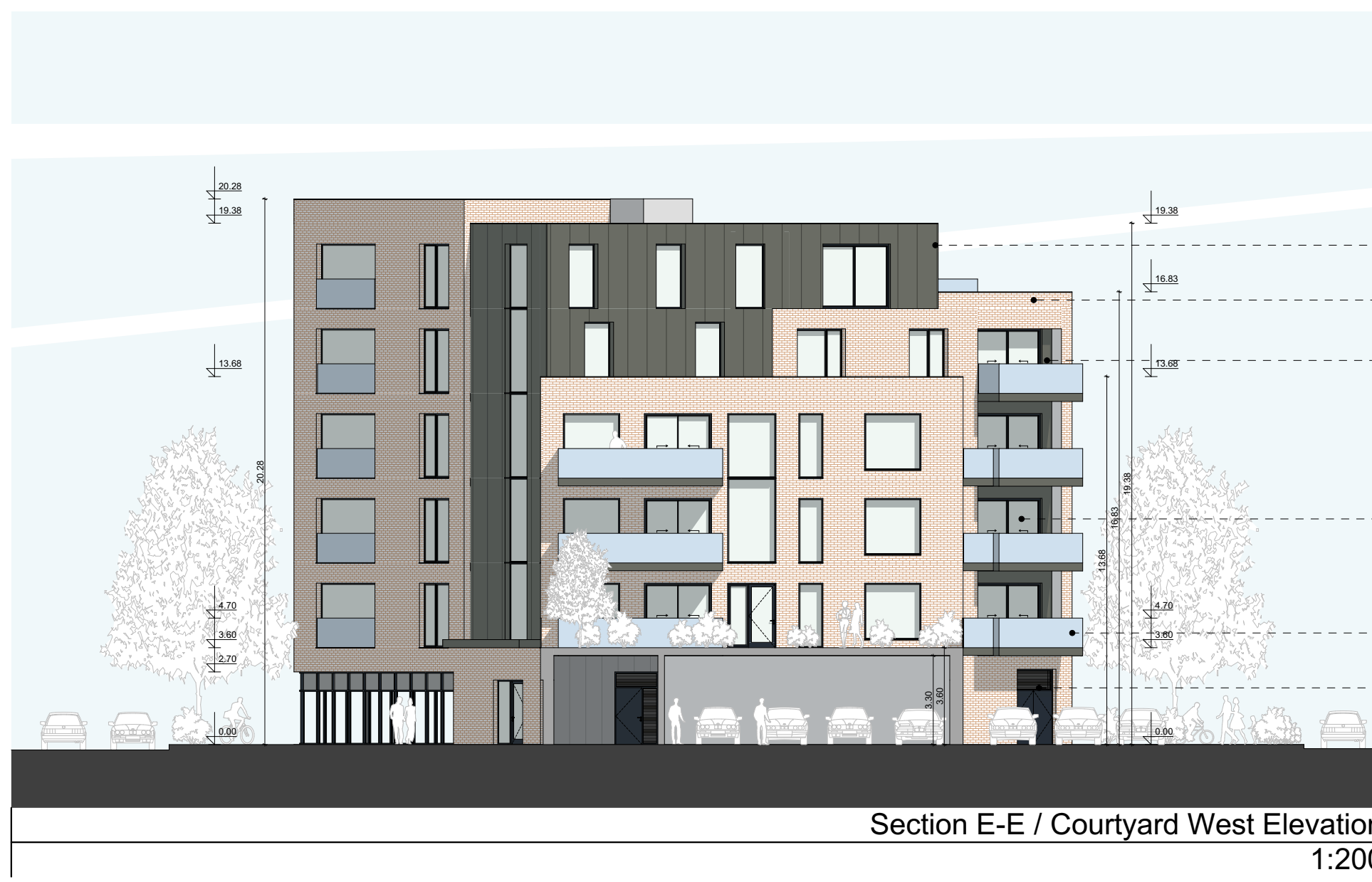
Section E-E / Courtyard West Elevation 1:200