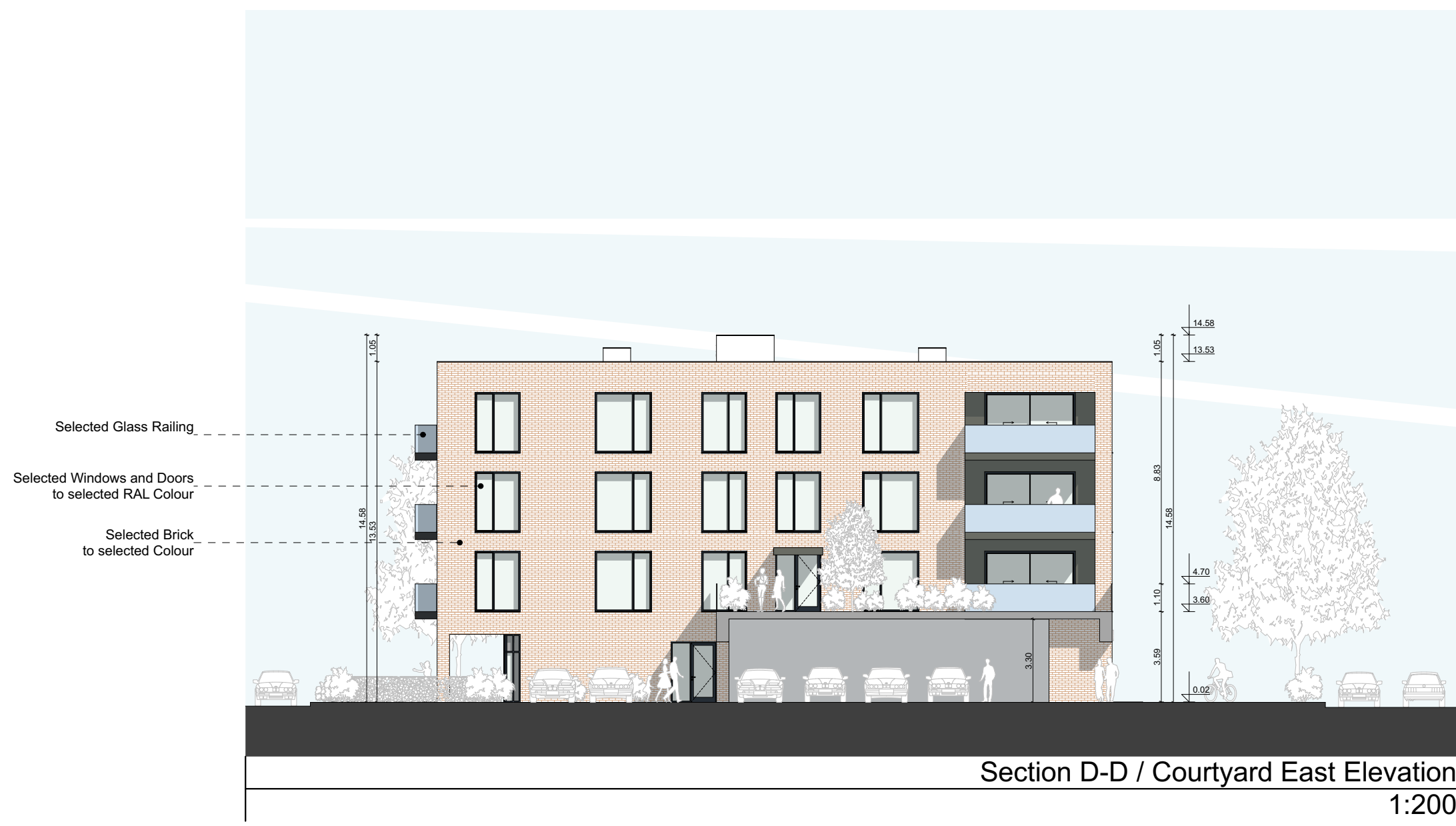
Section D-D / Courtyard East Elevation 1:200