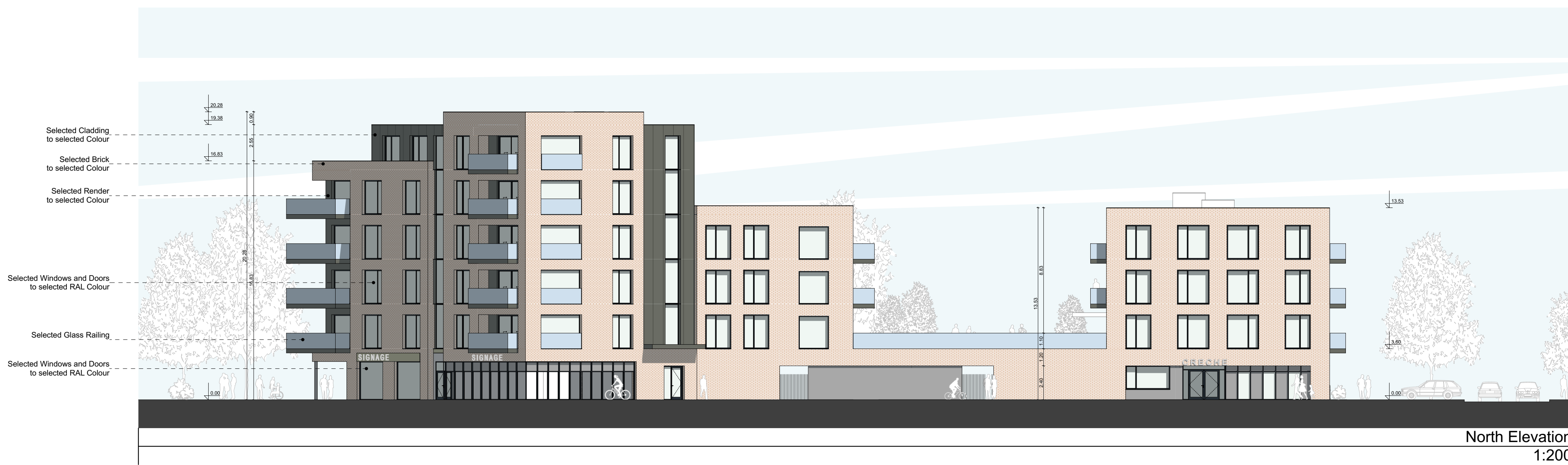
North Elevation 1:200